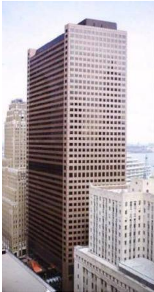
WTC 7: 47 - Story, steel-frame building.