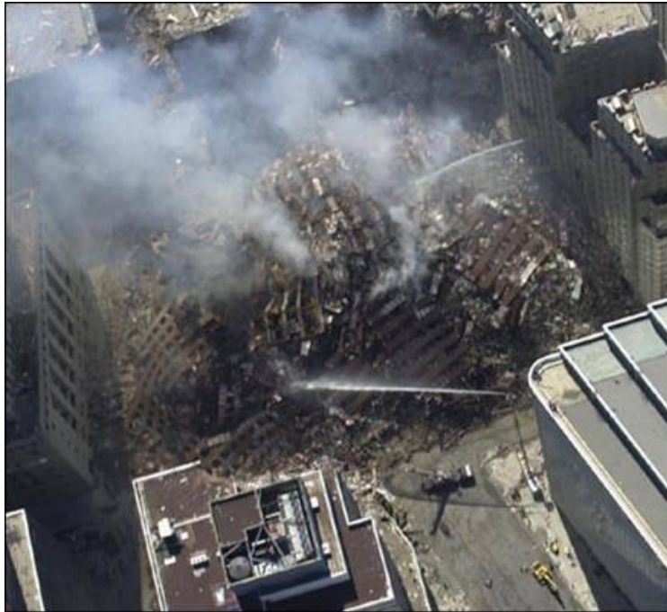
WTC 7 collapsed completely, onto its own footprint

Now that you have seen the still photographs, it is important to the discussion which follows for you to observe video clips of the collapse of this building, so go to: