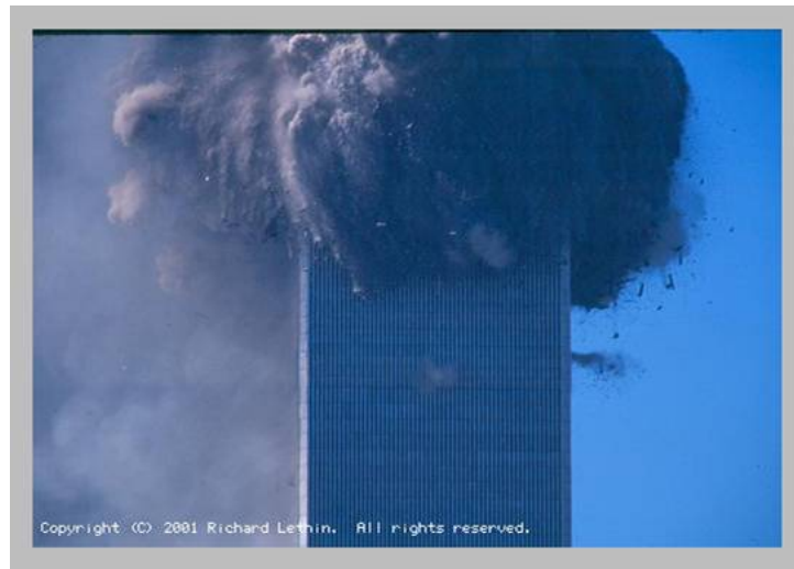
North Tower during top-down collapse.

The horizontal ejection of structural steel members for hundreds of feet and the pulverization of concrete to flour-like powder, observed clearly in the collapses of the WTC towers, provide further evidence for the use of explosives – as well-explained in http://911research.wtc7.net/talks/towers/index.html . (See also, Griffin, 2004, chapter 2.) The observed plumes or "squibs" are far below the pulverization region and therefore deserving of particular attention. They appear much like the plumes observed in http://www.implosionworld.com/cinema.htm (e.g., the controlled demolition of the Southwark Towers).