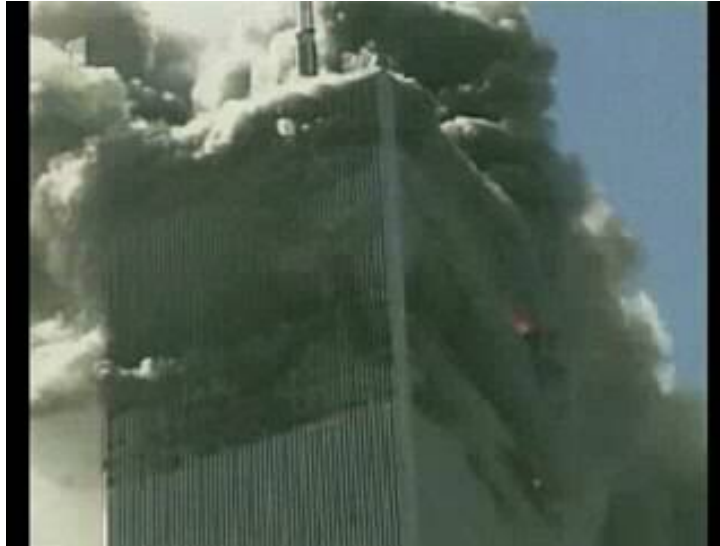
North Tower showing antenna (top) at beginning of collapse.

Yes, we can see for ourselves that the antenna drops first from videos of the North Tower collapse. (See http://911research.wtc7.net/wtc/evidence/videos/wtc1_close_frames.html ; also http://home.comcast.net/~skydrifter/collapse.htm .) A NY Times article also notes this behavior: