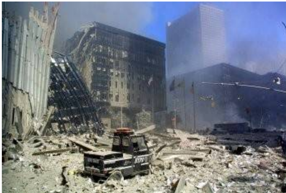
WTC 7 on afternoon of 9-11-01. WTC 7 is the tall sky-scraper in the background, right. Seen from WTC plaza area.