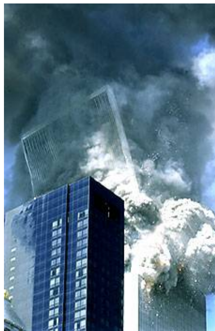
Top ~ 30 floors of South Tower topple over. What happens to the block and its angular momentum?

http://www.911research.com/wtc/evidence/videos/docs/south_tower_collapse.mpeg